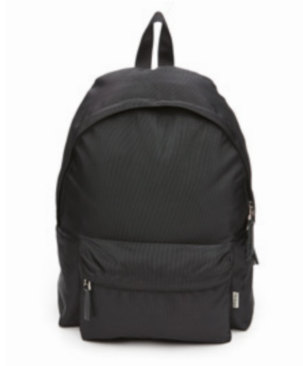
MATTE BLACK / 080-1100

Ballistic Nylon Construction Ripstop & Matte Nylon Construction Herringbone Polyester Outer Ideal Un-Structured Silhouette Premium Leather Tassels Mil-Spec Webbing Internal 15" Laptop Compartment Matte Black Zippers & Hardware