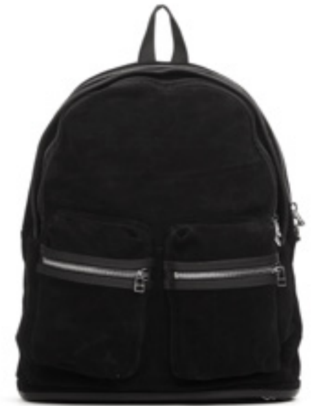
SUEDE BLACK / 160-3000

Ballistic Nylon Construction Italian Suede Construction Matte Nylon OX Lining Mil-Spec Webbing Premium Leather Tassels Water-Resistant Separate Bottom Compartment Dual Exterior Pockets Exterior 15" Laptop Sleeve Nickel Finish Zippers & Hardware