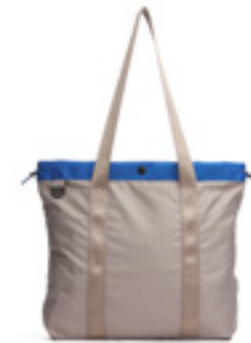
BLUE / 090-2500