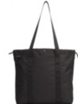
BLACK HERRINGBONE / 090-1300