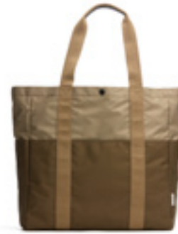
OLIVE / 030-3500