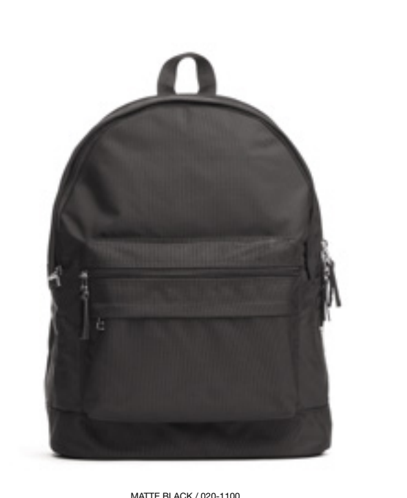
MATTE BLACK / 020-1100

Ballistic Nylon Construction Durable Nylon Construction Matte Nylon OX Lining Premium Leather Tassels Mil-Spec Webbing Multi Storage Solutions External 15" Laptop Compartment Nickel Finish Zippers & Hardware