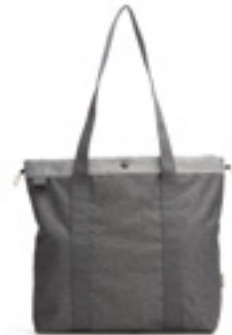
GREY HERRINGBONE / 090-6600