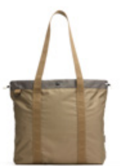
OLIVE / 090-3500