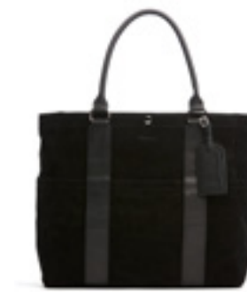
BLACK SUEDE / 130-3000