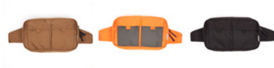
SEPIA / 010-6500