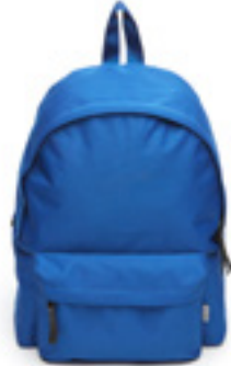
BLUE / 080-2500