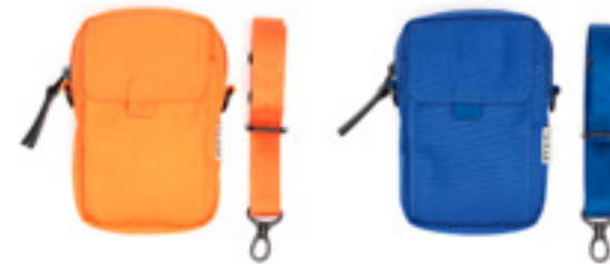
ORANGE / 210-8000