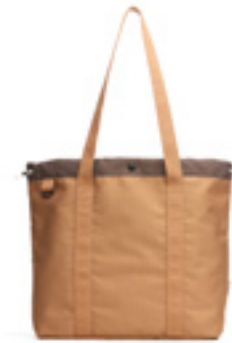
SEPIA / 090-6500