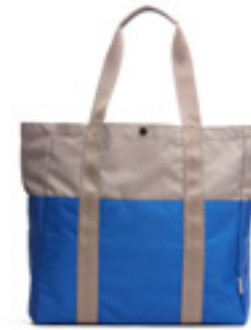
ROYAL / 030-2500