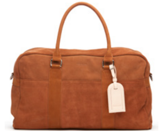
TOBACCO SUEDE / 150-2000

Italian Suede Construction Italian Leather Straps Handles Veg Tan Luggage Tag Cotton Twill Lining 2 External Open Pockets 3 Internal Magnetic Closure Pockets 1 Internal Zipped Pocket Nickel Finish YKK Zippers & Hardware Removable and Adjustable Leather & Nylon Shoulder Strap