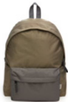
OLIVE GREEN / 080-3500