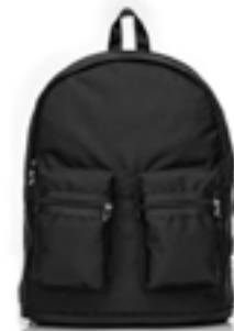
MATTE BLACK / 060-1100