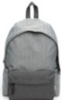
GREY HERRINGBONE / 080-6600