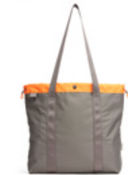
ORANGE / 090-2500