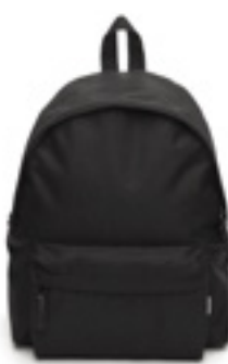
BLACK HERRINGBONE / 080-1300