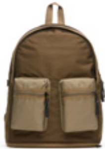
OLIVE / 260-3500