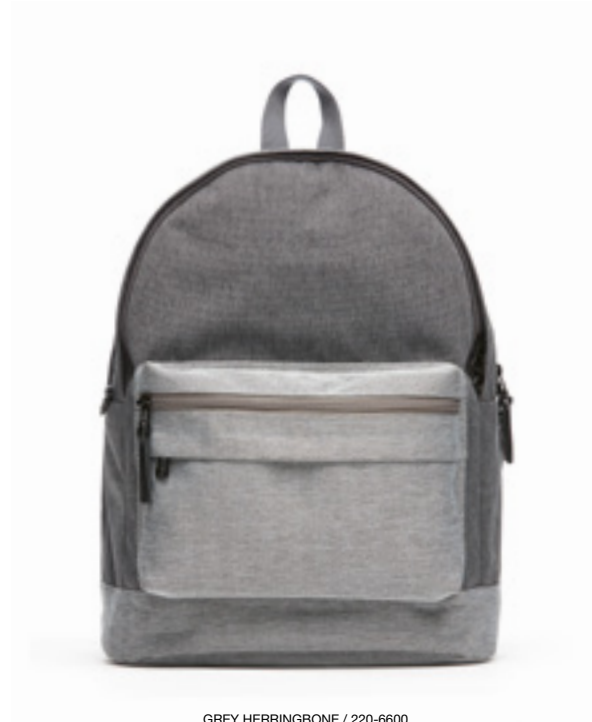
GREY HERRINGBONE / 220-6600

Durable Nylon Construction Herringbone Polyester Outer Matte Nylon OX Lining Premium Leather Tassels Mil-Spec Webbing Multi Storage Solutions External 15" Laptop Compartment Matte Black Zippers & Hardware