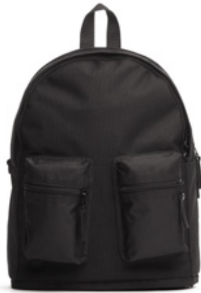
BLACK HERRINGBONE / 260-1300

Ripstop & Matte Nylon Construction Herringbone Polyester Outer Matte Nylon OX Lining Mil-Spec Webbing Premium Leather Tassels Water-Resistant Separate Bottom Compartment Dual Exterior Pockets Exterior 15" Laptop Sleeve Matte Black Zippers & Hardware