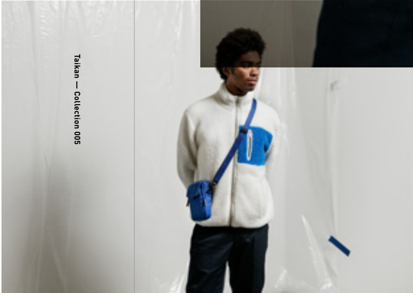
Taikan — Collection 005