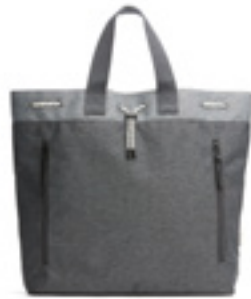
GREY HERRINGBONE / 290-6600