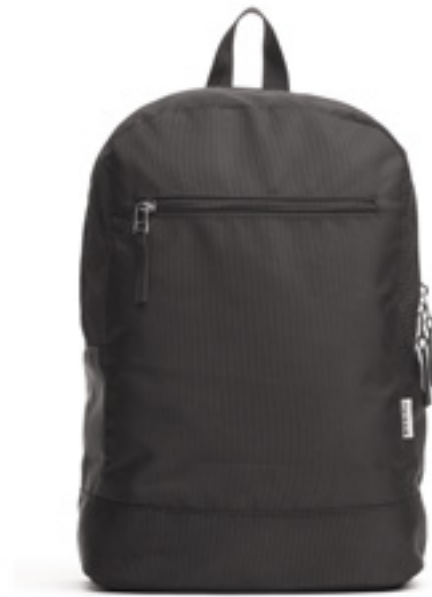
MATTE BLACK / 040-1100

Ballistic Nylon Construction Nylon OX Lining Premium Leather Tassels 2 Zipped Pockets 3 Open Pockets Interior 15" Laptop Compartment Nickel Finish Zippers & Hardware