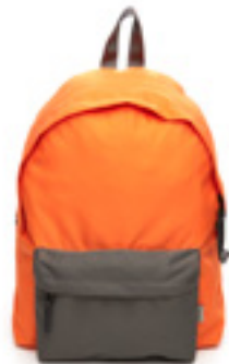
ORANGE / 080-8000