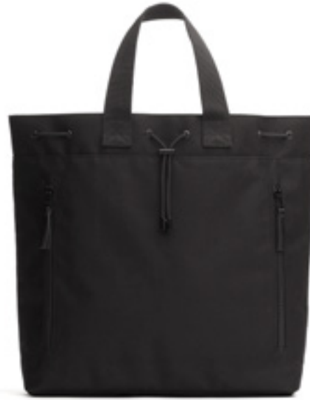
BLACK HERRINGBONE / 290-1300

Ripstop & Matte Nylon Construction Herringbone Polyester Outer Paracord Main Compartment Closure Premium Leather Tassels Mil-Spec Webbing 2 External Zipped Pockets Internal Multi Storage Solutions Matte Black Zippers & Hardware