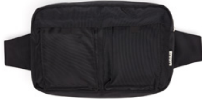
MATTE BLACK / 090-1100

Ballistic Nylon Construction Ripstop & Matte Nylon Construction Herringbone Polyester Outer Matte Nylon OX Lining Premium Leather Tassels Mil-Spec Webbing 3 Zipped Compartments 2 Magnetic Front Pockets Matte Black Zippers & Hardware