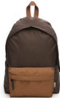
SEPIA / 080-6500