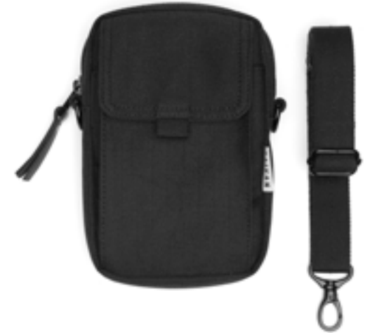
BLACK HERRINGBONE / 210-1300

Ripstop & Matte Nylon Construction Herringbone Polyester Outer Matte Nylon OX Lining Premium Leather Tassels Mil-Spec Webbing 2 Zipped Compartments Magnetic Front Pocket Matte Black Zippers & Hardware