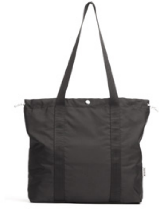
MATTE BLACK / 090-1100

Ballistic Nylon Construction Ripstop & Matte Nylon Construction Herringbone Polyester Outer Paracord Main Compartment Closure Mil-Spec Webbing Internal Multi Storage Solutions Matte Black Hardware