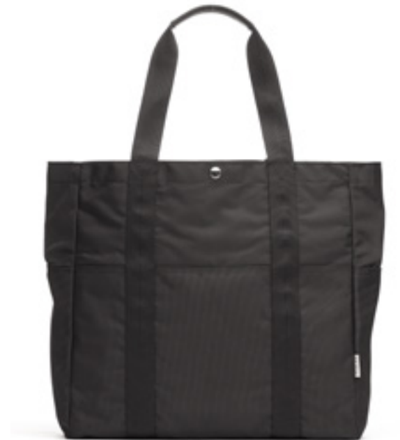
MATTE BLACK / 030-1100

Ballistic Nylon Construction Ripstop & Matte Nylon Construction Italian Suede Construction Matte Nylon OX Lining Premium Leather Handles Mil-Spec Webbing Internal Laptop Sleeve 2 Front & Back Slip Pockets 2 Magnetic Side Pockets Matte Black Hardware & Feet