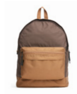
SEPIA / 220-6500